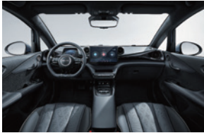
Black and grey