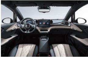
Black and brown